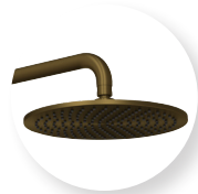
Brushed Bronze TRHWMBBZ