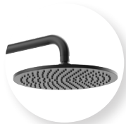
Matte Black TRHWMMB