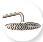
Brushed Nickel TRHWMBN