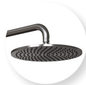
Brushed Gunmetal TRHWMGM