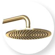
Brushed Gold TRHWMBG