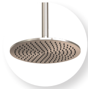
Brushed Nickel TRHCMBN