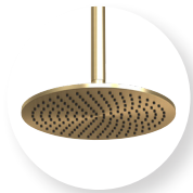
Brushed Gold TRHCMBG