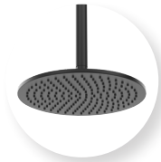
Matte Black TRHCMMB