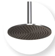
Brushed Gunmetal TRHCMGM