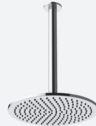
Chrome | TRHCMC