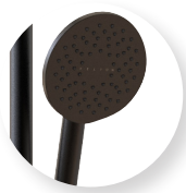
Matte Black THDRMB