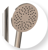
Brushed Nickel THDRBN