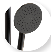
Matte Black Gloss Black THDRMB-GB