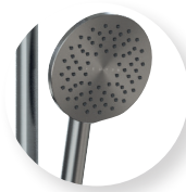
Brushed Gunmetal THDRGM