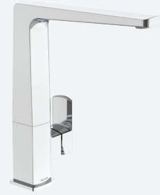
Chrome | Q2SMC