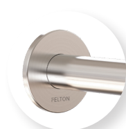
Brushed Stainless Finish MORBSBN