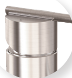
Brushed Stainless Finish MORBMBN