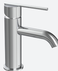
Chrome | MORBMC