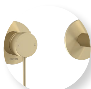
Brushed Gold LBFBG