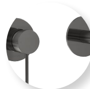
Brushed Gunmetal LBFGM