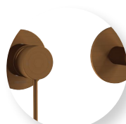
Brushed Bronze LBFBZ