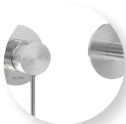
Brushed Stainless Finish LBFBN