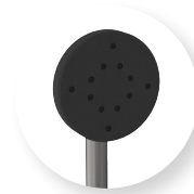
Brushed Gunmetal HS0086