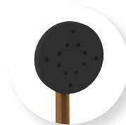
Brushed Bronze HS0089