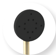
Brushed Gold HS0088