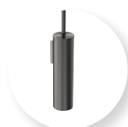
Brushed Gunmetal C-WMTBHGM