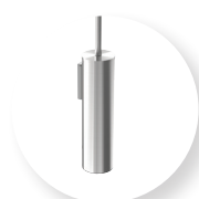
Brushed Stainless Finish C-WMTBHBN