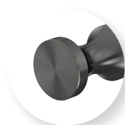
Brushed Gunmetal C-WHGM