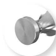
Brushed Stainless Finish C-WHBN