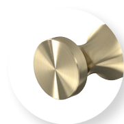
Brushed Gold C-WHBG