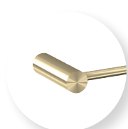
Brushed Gold C-TR450BG