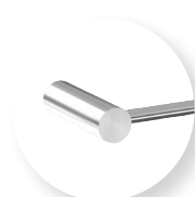
Brushed Stainless Finish C-TR300BN