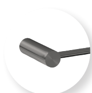
Brushed Gunmetal C-TR300GM