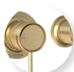
Brushed Gold NZ TBFBG AU TBFBGA