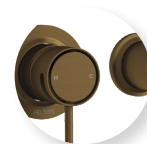
Brushed Bronze NZ TBFBZ AU TBFBZA