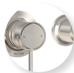
Brushed Stainless Finish NZ TBFBN AU TBFBNA