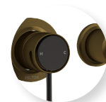
Brushed Bronze / Black NZ TBFBZ-MB AU TBFBZ-MBA