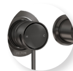
Brushed Gunmetal NZ TBFGM AU TBFGMA