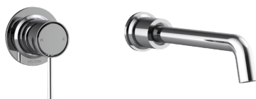
Chrome | NZ TBFC AU TBFCA