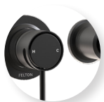
Black NZ TBFMB AU TBFMBA