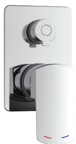
Chrome | NZ QVDSMC