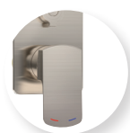
Brushed Stainless Finish NZ QVDSMBN