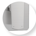
Brushed Stainless Finish NZ QFSPCSMBN