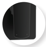
Black NZ QFSPCSMB