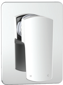
Chrome | NZ QFSPSCMC