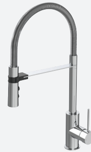
Chrome | LSMC02